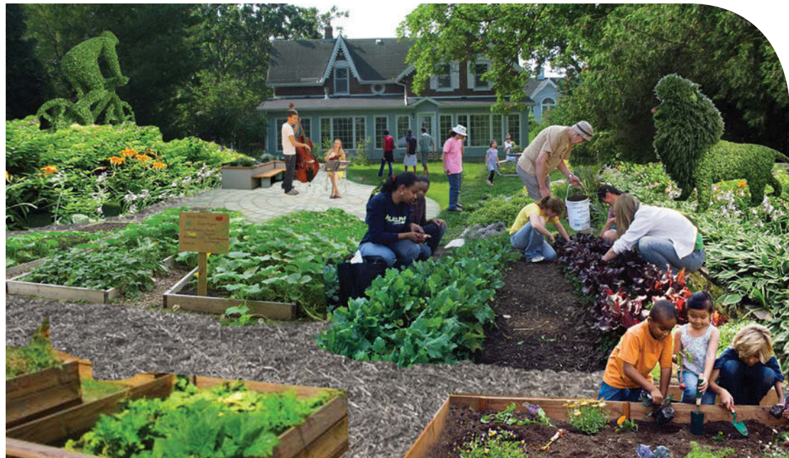
Vision for ClearWater Farm