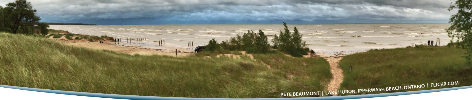
LAKE HURON, IPPERWASH BEACH, ONTARIO