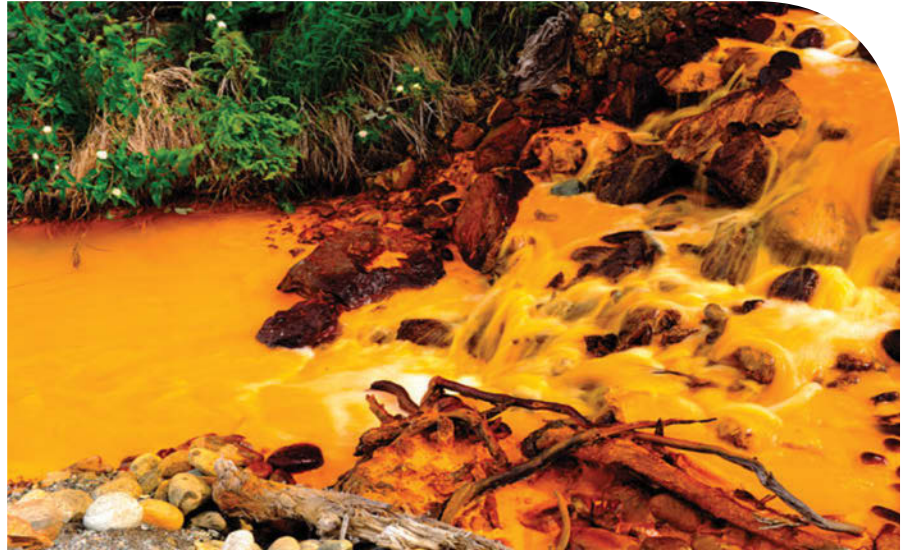
Across the country sulfide mining has been polluting surface and/or groundwater with acid mine drainage, sulfuric acid and/or toxic metals.

WaterLegacy is also a leader in advocacy efforts to state and federal agencies, bring together groups from around the state and region