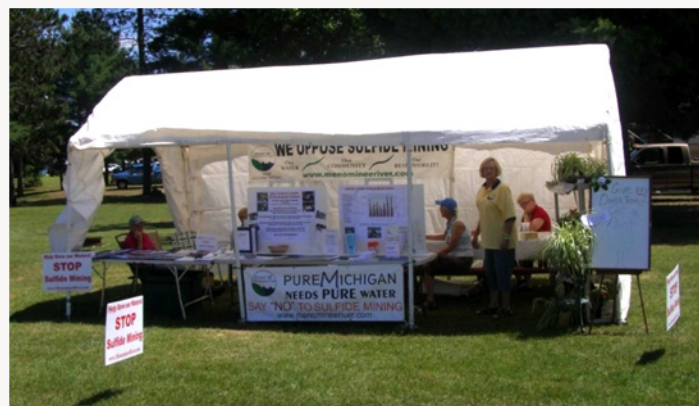
Members of Front 40 work to protect their water.

Front 40’s leadership on mining issues has resulted in several municipal resolutions against the Back Forty mine and increased understanding of the threats to water resources from open pit sulfide mining. Freshwater Future is pleased to present Front 40 with a Freshwater Hero Award for their work to prevent waters from being impacted from mining development.