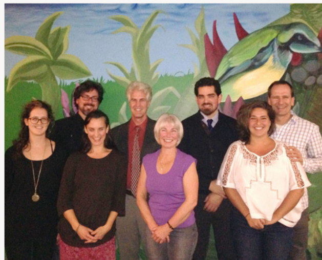
Wellington Water Watchers Team

What makes the Wellington Water Watchers such an effective Freshwater Hero is their strong handle on the technical aspects of the issue—which means everyone—from government to media—often want to talk to them. The group's creativity, passion, and bravery in the face of opposition, makes them one of Canada's great water champions, and Freshwater Future is thrilled to recognize them as a Freshwater Hero.