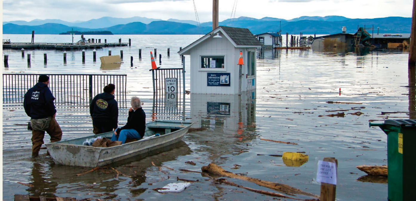
Excessive rain in the spring of 2011 caused flooding around Lake Champlain.