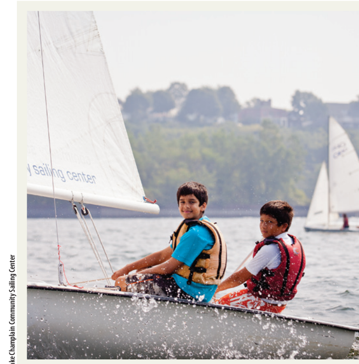
A cared for lake makes for an enjoyable summer day.

"[W]e became very concerned that the...targets were understated and as a result that the whole effort to reduce pollution was calibrated to fail. So even if we had achieved the reductions we were hoping for, we would look at the lake and we would see a lake that is still so heavily polluted..." says Iarrapino.