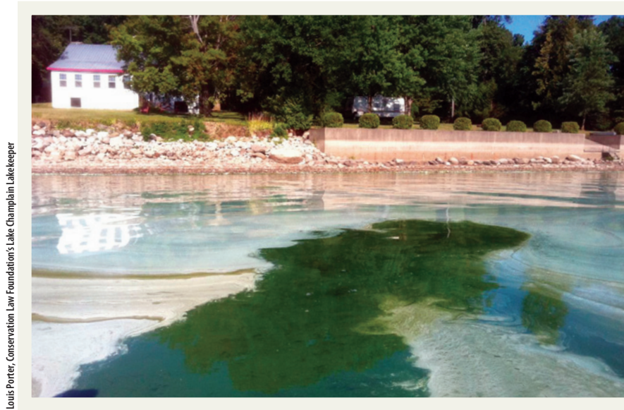
No swimming today. The toxic blue-green algae bloom in Lake Champlain is spurred by phosphorus pollution. A stronger Pollutant Load level that takes into account changing climate conditions will reduce the frequency of these blooms.

In order to calculate the contribution of non-point source pollutants, the EPA uses watershed models based on how much precipitation (rain and snow) falls in a single year. In the case of Lake Champlain, 1991 was chosen as the representative year and used to determine the total non-point source pollutant amount. However, since 1991 there has been a trend toward wetter years overall and more intense storms that produce higher flows. More precipitation and higher flows mean more polluted runoff, whether it's through erosion from a farm field with layers of fertilizer or from a construction site. In a nutshell, by using precipitation numbers that were already 10 years old and ignoring long-term trends in precipitation and storminess, the 2002 Pollutant Load was likely to grossly underestimate the amount of non-point source pollution.