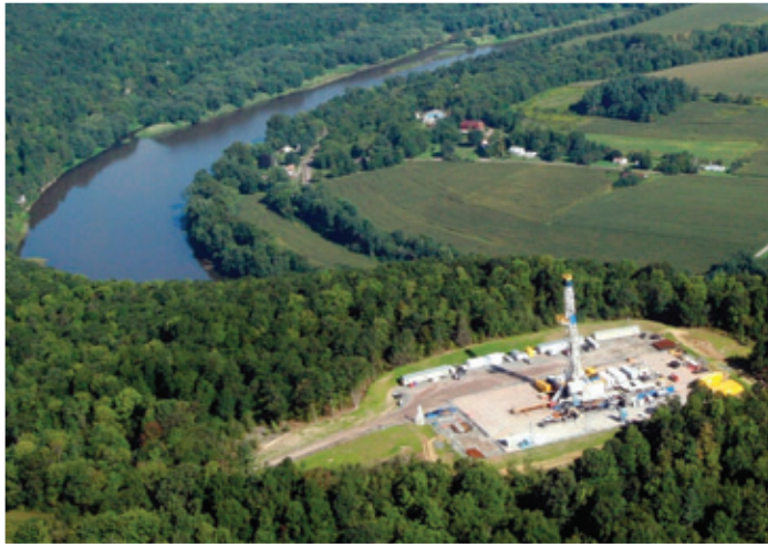
A Pennsylvania fracking well and the Susquehanna River.