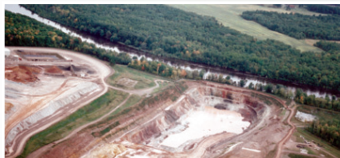
Flambeau Mine site near Ladysmith, Wisconsin

Freshwater Future Researched and published a scientific paper clarifying the impacts of temperature variations on the production of acid at mining sites. Additionally, we utilized new social media tools to connect citizens and elected officials in an effort to prevent weakening the public input process for mining on public lands.